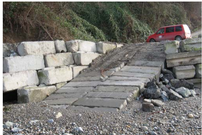
New Beach Access Ramp at base of Div H hill near Sunset Park