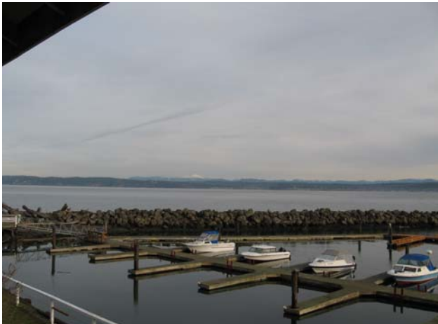
View of Marina from Marina Apartment Veranda with Mt Baker in the distance