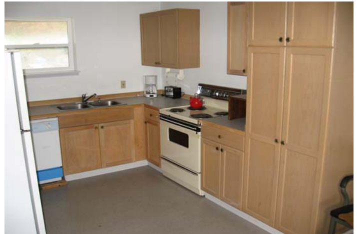
Fully equipped kitchen in Marina Apartment

Beginning this spring the Island will offer the Marina apartment for rent on a daily and weekly basis. The apartment is located above the Island office in the marina. The apartment is fully furnished with all the necessary furnishings including a fully equipped kitchen, and bed and bath linens. The bedroom can be configured as either a king or two twin beds. The living room has a queen sofa bed and a twin rollaway bed. It’s a perfect place for in-laws or friends or for weeks of working on your property. Relax on the veranda over looking the marina, enjoy Direct TV, and walk on the beach. You bring food and we supply everything else. Reservations made through the island office. Prices as below.