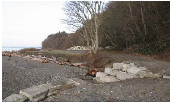
Sunset Park with ecology blocks in the distance

Sunset Park (sometimes known as Conwell Park), the filled parking area at the base of the Division H hill, was constructed in the late 1990's as a place to dispose of debris from land slides in Division H. Unfortunately the Island did not get the appropriate grading permits and was subsequently cited by the county for its construction. That citation is still pending in Snohomish County Court. As a part of the approval and permitting process for the repair of the Division H bulkhead we have been required to allow that area to be "reclaimed by nature". So as a part of the Div H construction we installed a concrete block ramp at the NW end of the bulkhead to facilitate continued beach access. The narrow stretch of road that connects to the "park" will be protected only until we have removed the displaced ecology blocks currently stored there. After that we must allow Puget Sound to reclaim the area to its original and natural state.