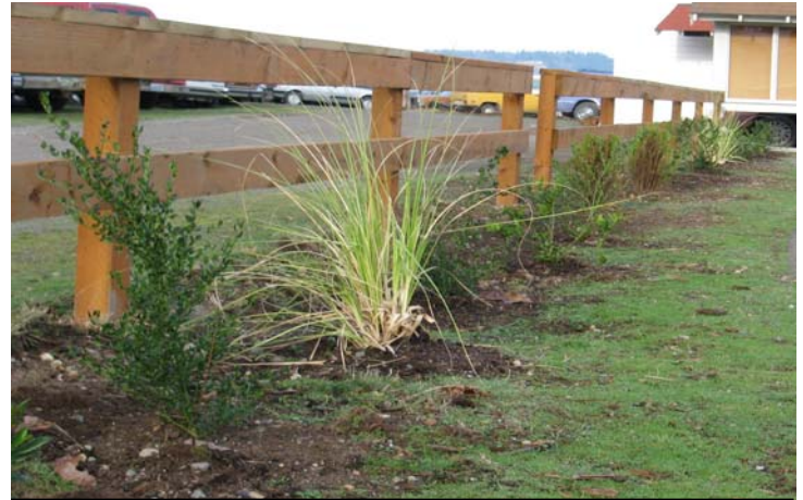
Newly donated and installed plants along new volunteer built fence